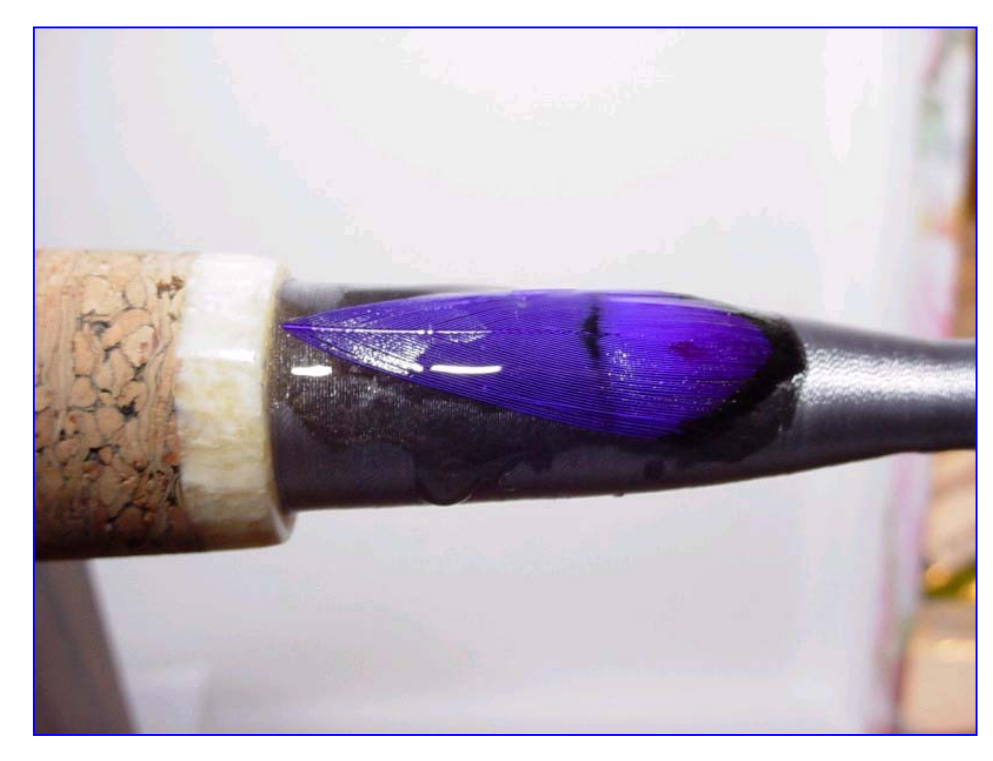
Step 5 Applying permagoss, smooth the feahter into place, trying to make it look natural laying on the rod. Let it dry and you are ready to coat it with a finishing epoxy like LS Supreme